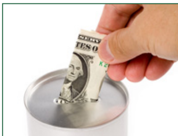
Calls for Asian seafarer training fund to be set up

A Singapore fund would not just provide training for Singapore-national seafarers but also to those from other Asian countries, as with a population of just 4m its own seafarer pool will never be sufficient to meet the demand of