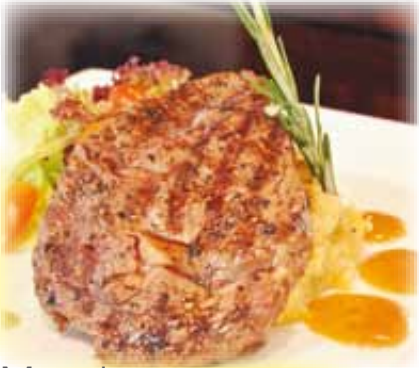
Monday Juicy Rib Eye steak with mashed potatoes

Free flow greens, soup and a cup of coffee/ tea when you order our daily specials!