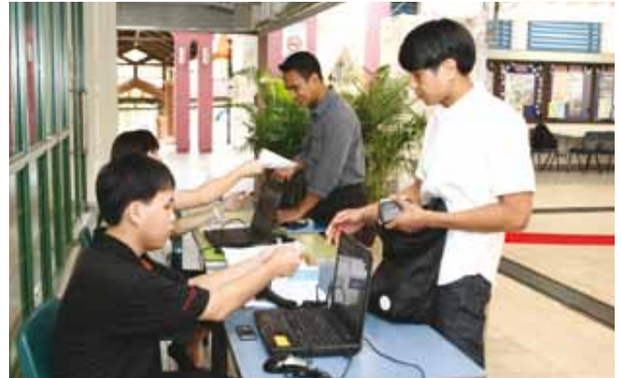
e2i officers screening applicants