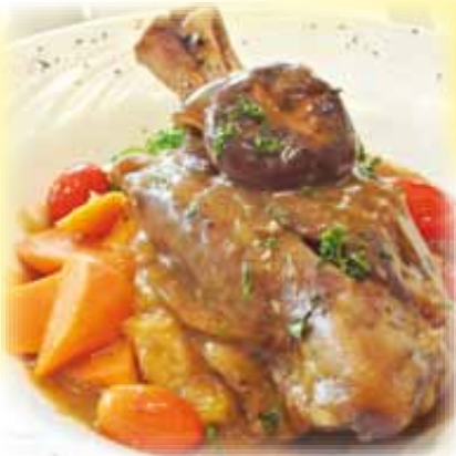
Wednesday Lamb Shank with mashed potatoes and vegetables