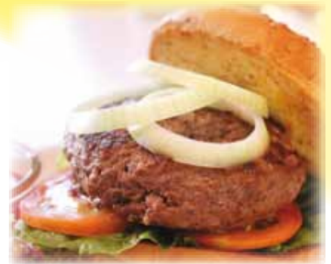
Friday Wagyu Beef Burger with chips