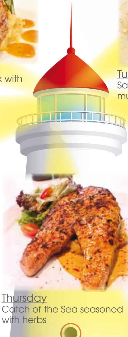
Thursday Catch of the Sea seasoned with herbs