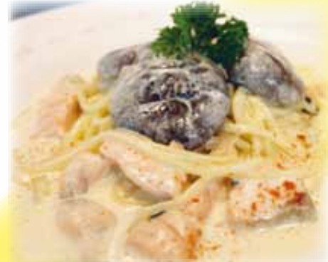
Tuesday Salmon Pasta with sauteed mushroom