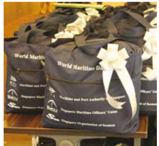
Hampers for seafarers brimming with food and entertainment