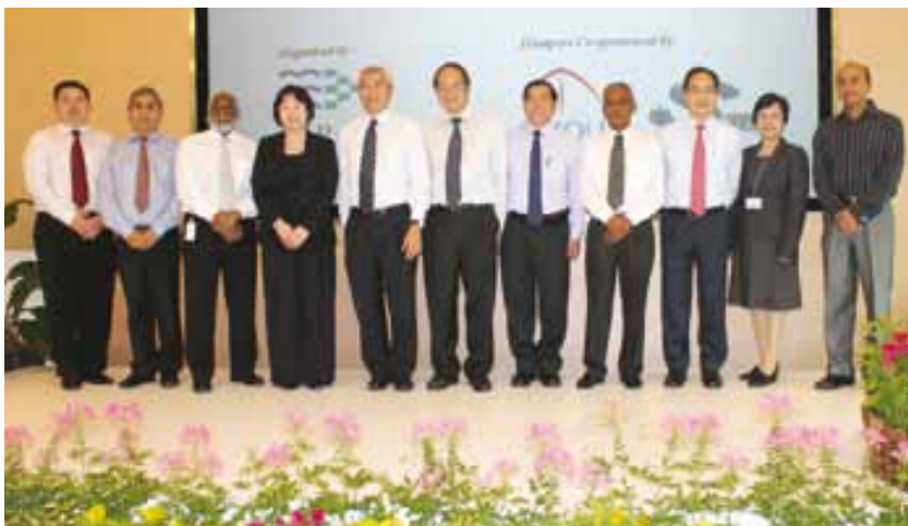
Officials at the World Maritime Day Hamper Presentation