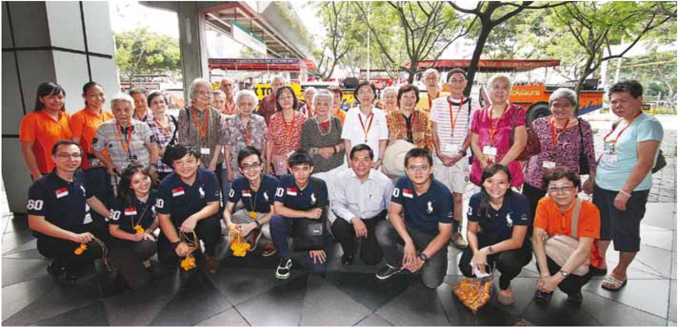
Our youth volunteers enthusiastic about bringing the seniors on a short voyage

Seniors from the Henderson Senior Citizens' Home, SMOU adopted charity, had a special treat on 29 November, as Young SMOU representatives brought them out for a day of sightseeing, caroling, and feasting.