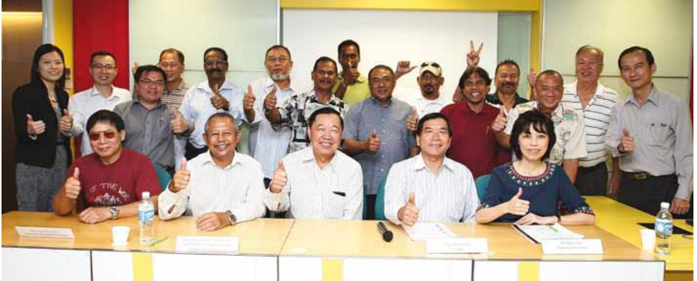
SMOU Harbourcraft Members at the Members' Dialogue

SMOU held a highly interactive dialogue to encourage more Singaporean seafarers to return to sea.