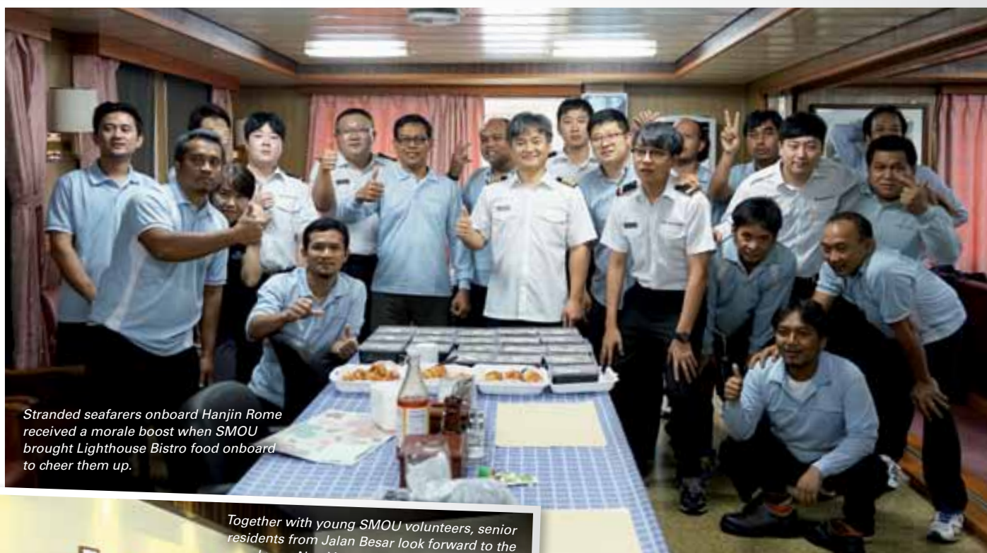
Stranded seafarers onboard Hanjin Rome received a morale boost when SMOU brought Lighthouse Bistro food onboard to cheer them up.

The bistro was awarded the TripAdvisor Certificate of Excellence in 2017 for its outstanding service and quality, and it gets a five star when it comes to doing its part to serve with a good heart.