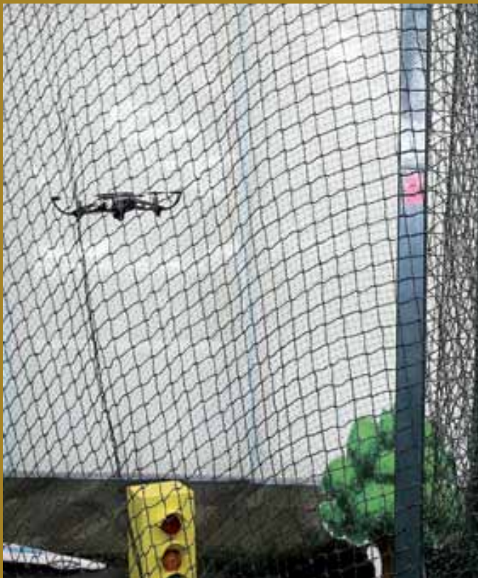
Getting a firsthand experience on flying a drone.