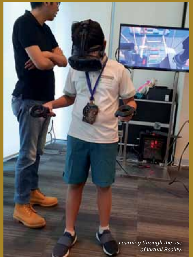
Learning through the use of Virtual Reality.

"Whether you are a primary school student or pre-university youth, it is good to raise awareness and instill an interest in technology."