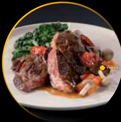
Sou Vide Australian Rib Eye