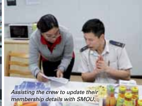
Assisting the crew to update their membership details with SMOU.

“ Before this experience, I thought that the crew had to work tirelessly 24/7, whether at sea or in port. It was extremely heartening to learn that there are designated watch shifts and sufficient rest time in place, so that the crew can have a social life on board as well. While we were onboard, we also joined in a happy hour party.