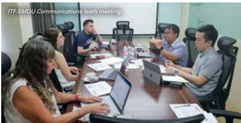
ITF-SMOU Communications team meeting.

The ITF Singapore National Coordinating Committee (SNCC) has been assisting the working committee in ensuring that the Congress runs smoothly, right from the beginning.