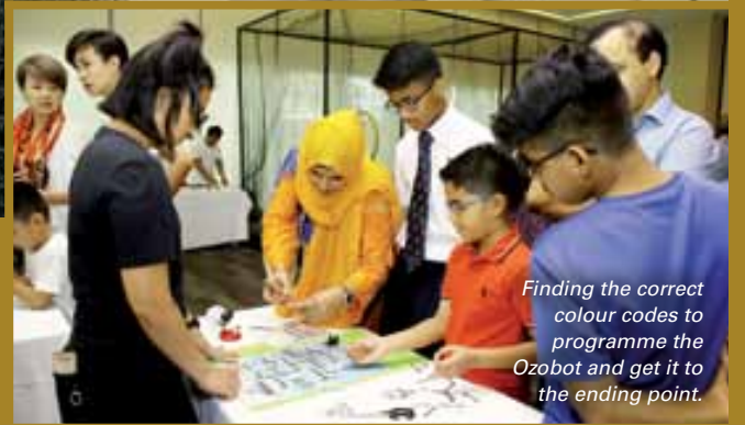
Finding the correct colour codes to programme the Ozobot and get it to the ending point.