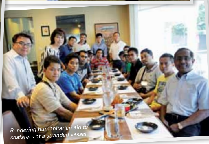
Rendering humanitarian aid to seafarers of a stranded vessel.