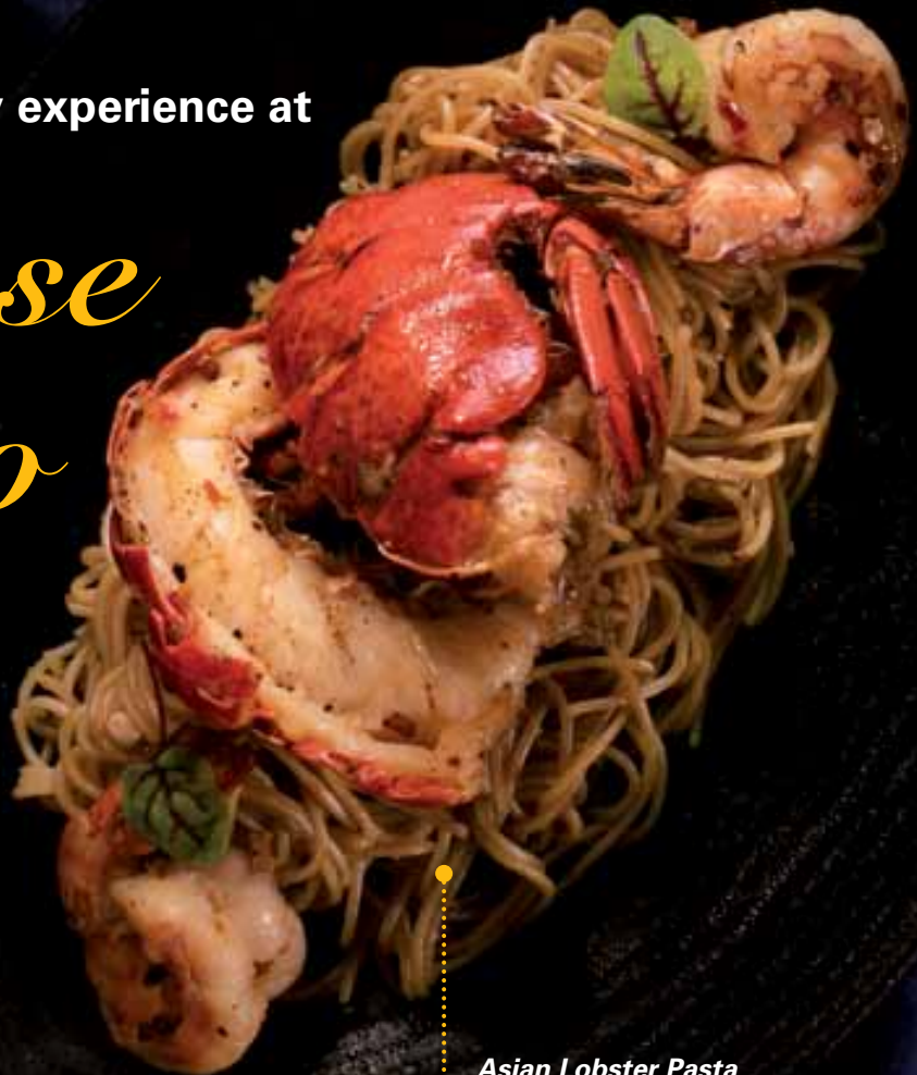
Asian Lobster Pasta