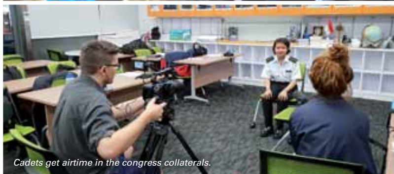
Cadets get airtime in the congress collaterals.