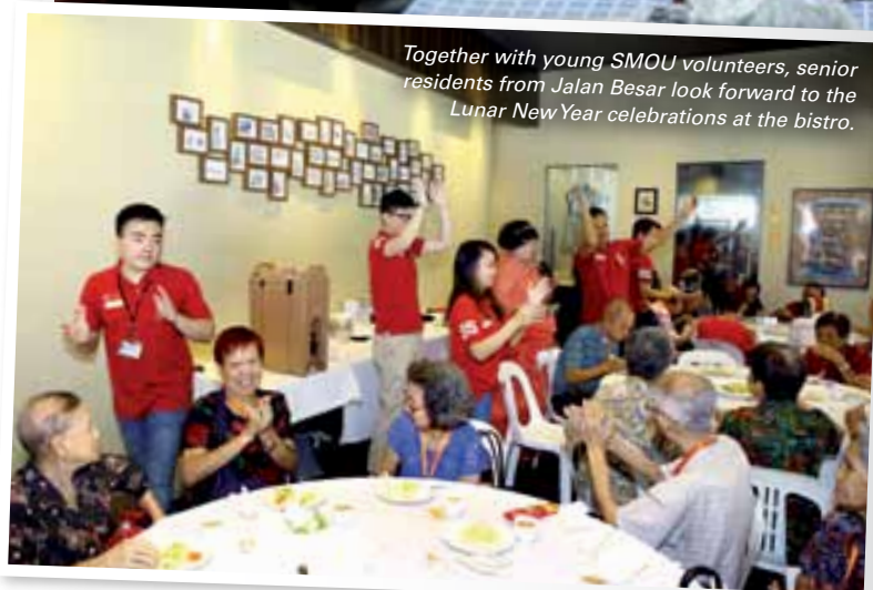
Together with young SMOU volunteers, senior residents from Jalan Besar look forward to the Lunar New Year celebrations at the bistro.