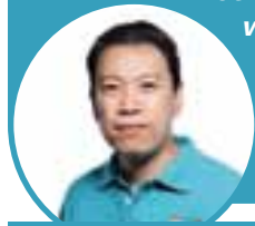
Labour MP Melvin Yong, NTUC Assistant Secretary-General

“ As we work on upskilling our workers and transitioning to the new economy, we must also not forget to ensure that we have safe workplaces and healthy workers. We should, and must do more to provide safer workplaces, and build an ecosystem for all our workers to stay healthy.”