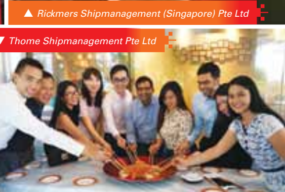
▼ Thome Shipmanagement Pte Ltd