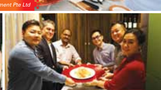
▲ Rickmers Shipmanagement (Singapore) Pte Ltd