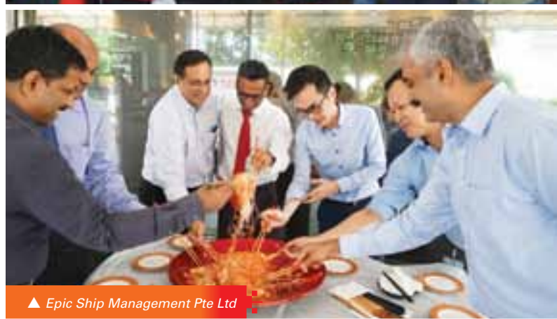
▲ Epic Ship Management Pte Ltd