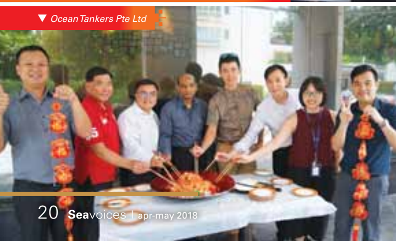
▼ Ocean Tankers Pte Ltd