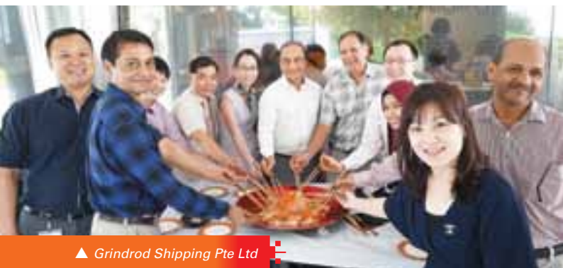
▲ Grindrod Shipping Pte Ltd