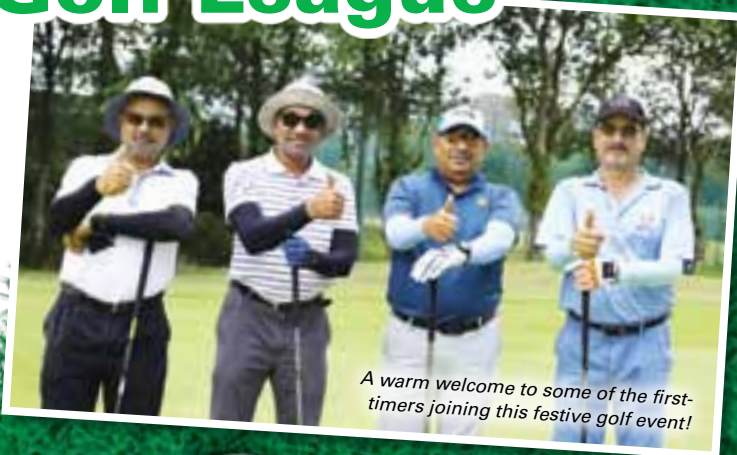
A warm welcome to some of the first-timers joining this festive golf event!

Though no winners were declared this year as the golf tournament was called off halfway due to the bad weather, they were delighted that they stood the chance to win the competition prizes via a special draw. The auspicious lo hei during dinner brought an added festive cheer to the evening.