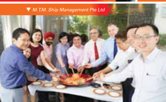
▼ M.T.M. Ship Management Pte Ltd