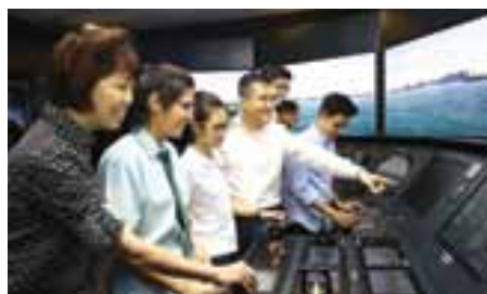
A sneak peak of what goes on at the bridge of the ship at the Wavelink Maritime Simulation Centre