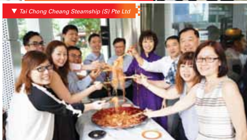
▼ Tai Chong Cheang Steamship (S) Pte Ltd