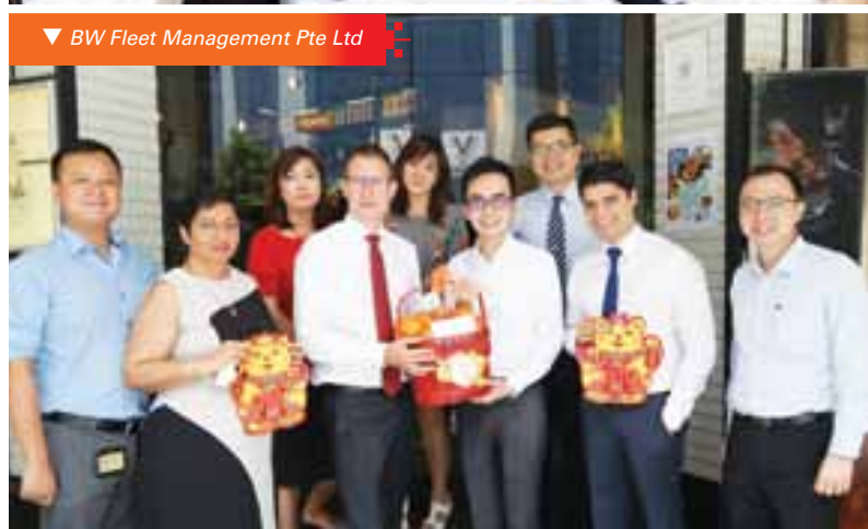
▼ BW Fleet Management Pte Ltd