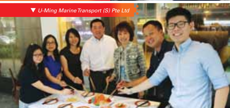
▼ U-Ming Marine Transport (S) Pte Ltd