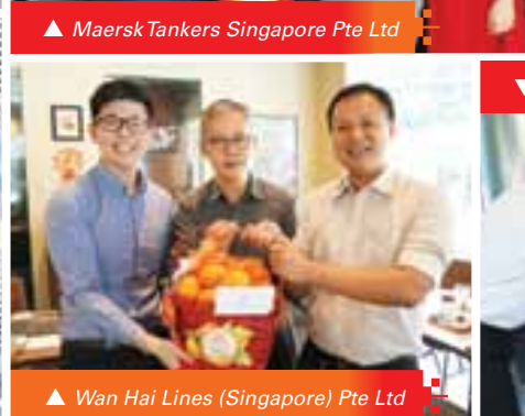
▲ Wan Hai Lines (Singapore) Pte Ltd