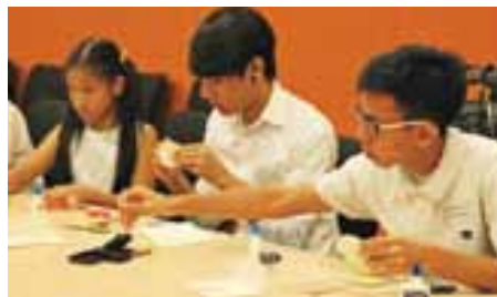
Recipients working on handmade cards for their parents