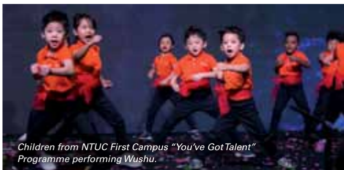
Children from NTUC First Campus "You've Got Talent" Programme performing Wushu.

SMOU also contributed $84,000 towards the Bright Horizons Fund which supports the "You've Got Talent" Programme by NTUC First Campus; a programme which enables children from low-income families to participate in extra-curricular activities. One of the skills they learnt was Wushu, which was performed by the children during the Lunar New Year Luncheon and Hong Bao Presentation this year.