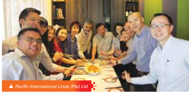
▲ Pacific International Lines (Pte) Ltd