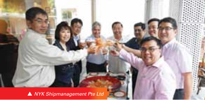
▲ NYK Shipmanagement Pte Ltd