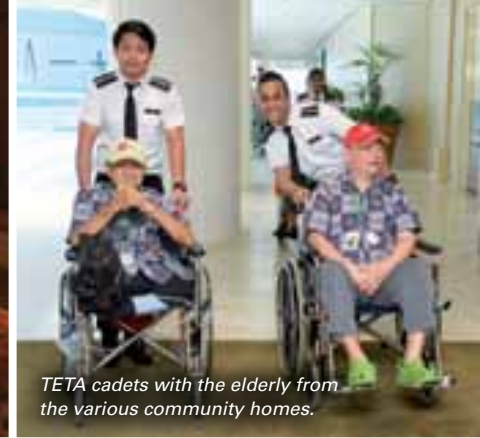
TETA cadets with the elderly from the various community homes.