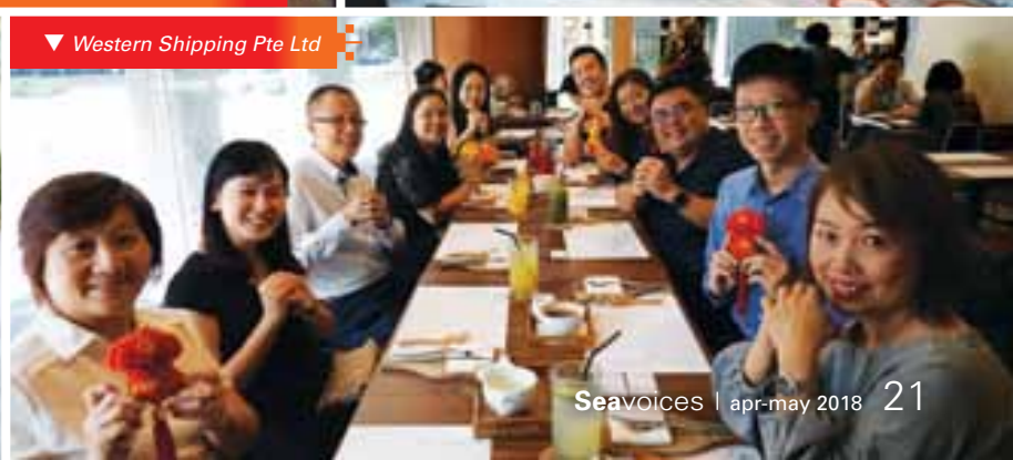
▼ Western Shipping Pte Ltd