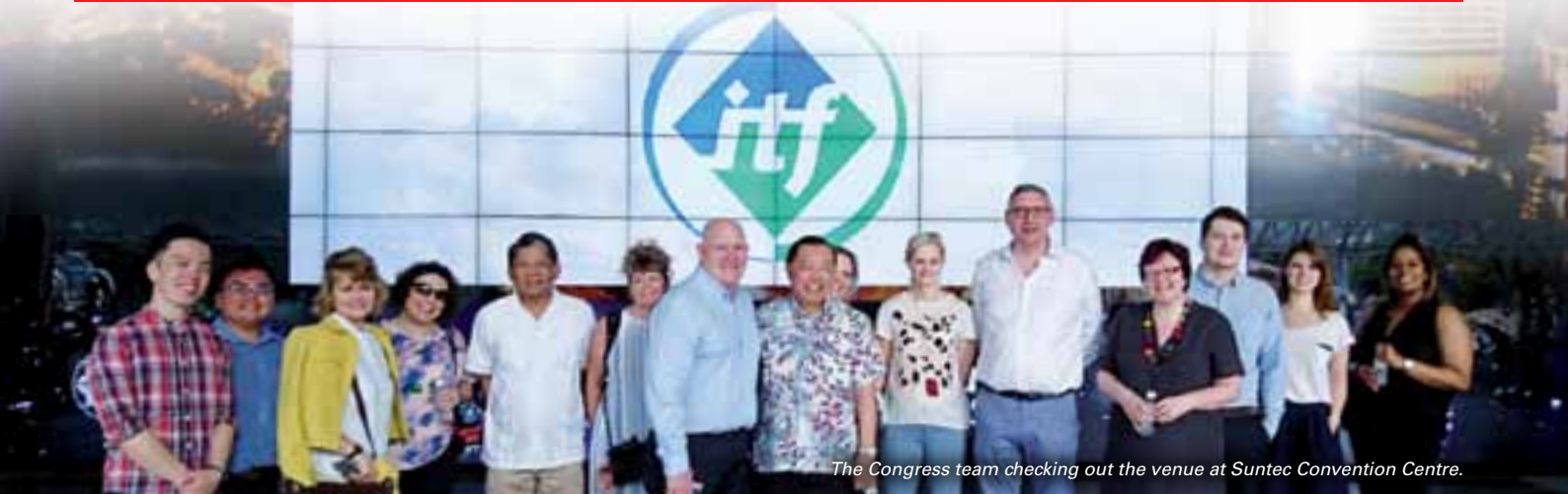
The Congress team checking out the venue at Suntec Convention Centre.