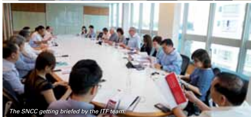
The SNCC getting briefed by the ITF team.