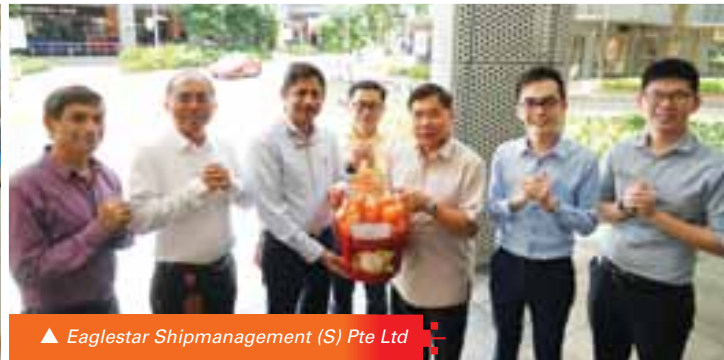
▲ Eaglestar Shipmanagement (S) Pte Ltd