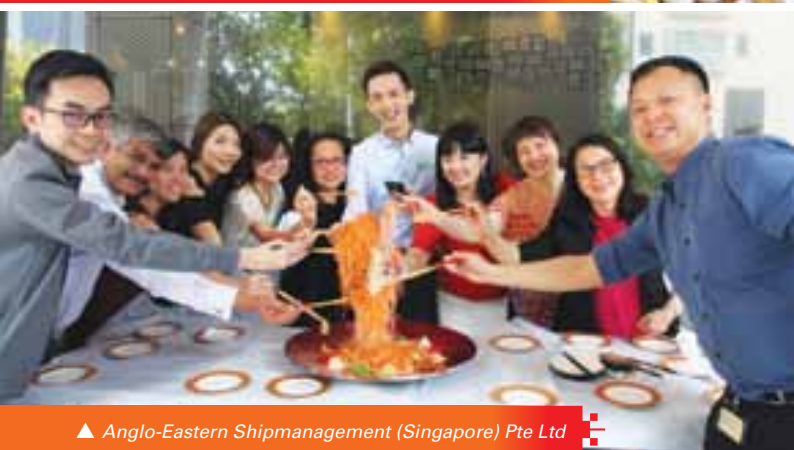
▲ Anglo-Eastern Shipmanagement (Singapore) Pte Ltd