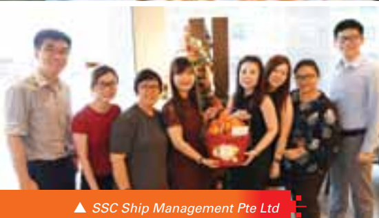
▲ SSC Ship Management Pte Ltd