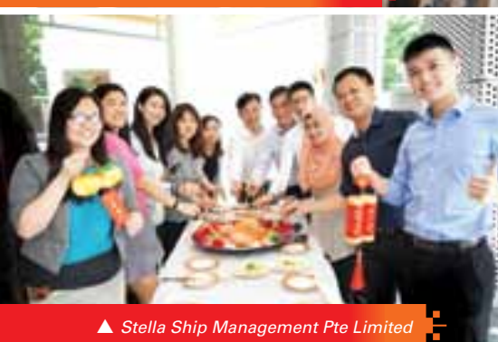
▲ Stella Ship Management Pte Limited