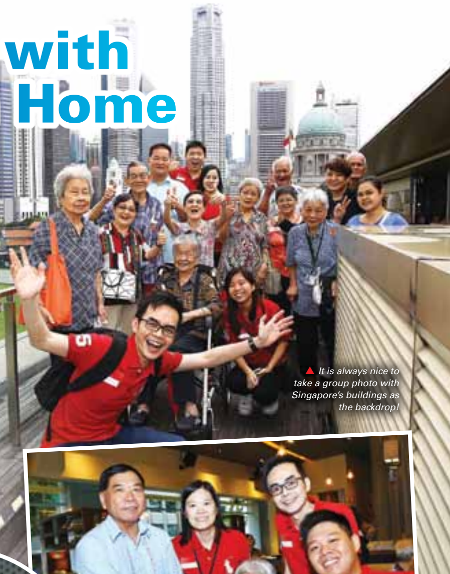
▲ It is always nice to take a group photo with Singapore’s buildings as the backdrop!