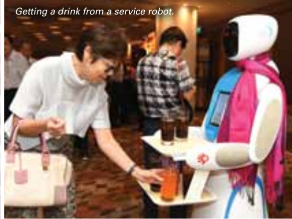
Getting a drink from a service robot.