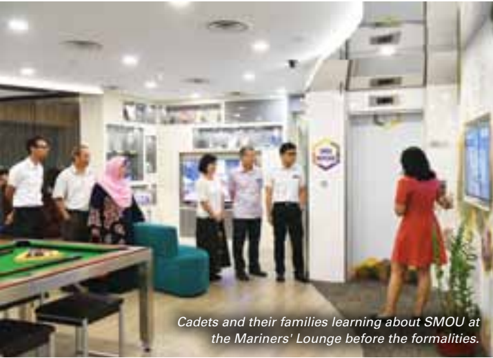
Cadets and their families learning about SMOU at the Mariners' Lounge before the formalities.