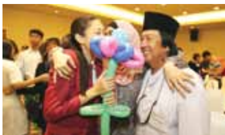
Touching moments of recipients presenting the handmade gifts and thanking their parents

More than just an awards presentation, it will also be a day of learning and enrichment for all recipients. The following are what our past recipients have experienced: