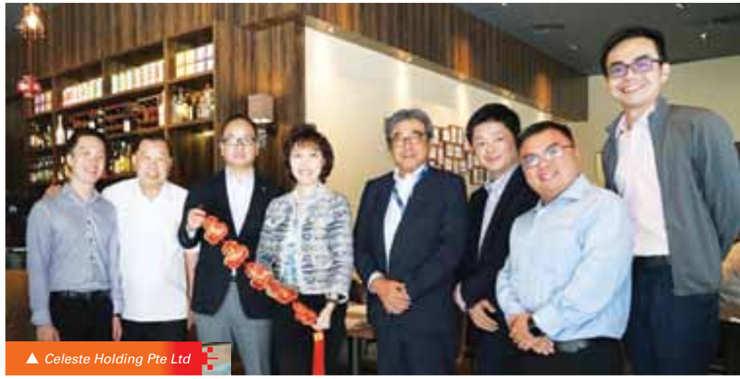
▲ Celeste Holding Pte Ltd

The Lunar New Year lo hei sessions are a treasured opportunity to get together and strengthen the relationships between SMOU and our Collective Agreement companies. There were delightful and heartwarming moments as both parties tossed to reaffirm their collaborative ties and wish for a smooth-sailing new year.