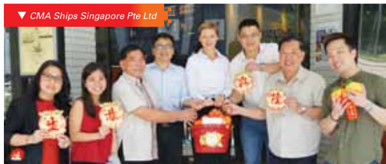
▼ CMA Ships Singapore Pte Ltd