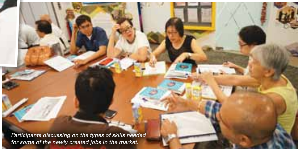
Participants discussing on the types of skills needed for some of the newly created jobs in the market.