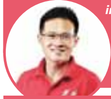
Labour MP Desmond Choo, NTUC Assistant Secretary-General

“ Could the Government also consider making eldercare or family care leave mandatory in Singapore? This could provide some relief to Singaporeans who must take care of family members who are not covered by childcare leave or parental leave.”