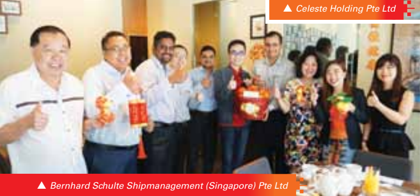
▲ Bernhard Schulte Shipmanagement (Singapore) Pte Ltd