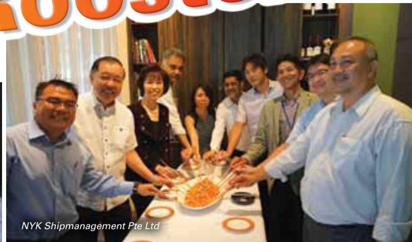
NYK Shipmanagement Pte Ltd