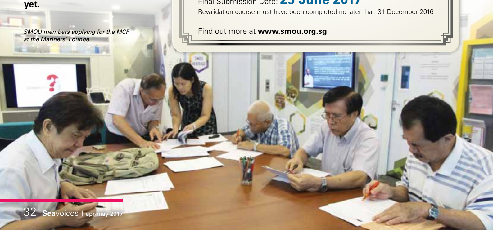
SMOU members applying for the MCF at the Mariners' Lounge.