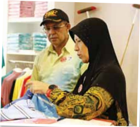
So many choices, it's so hard to choose!