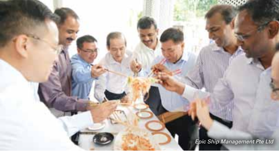
Epic Ship Management Pte Ltd