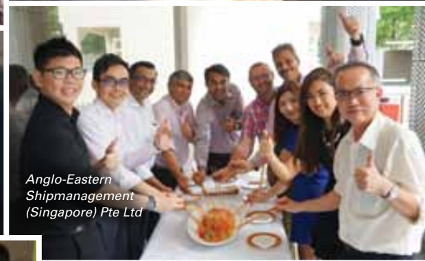
Anglo-Eastern Shipmanagement (Singapore) Pte Ltd