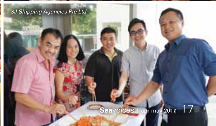
3J Shipping Agencies Pte Ltd