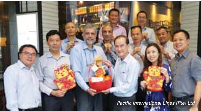
Pacific International Lines (Pte) Ltd

Warm greetings and wishes for prosperity and good health were exchanged at the Lighthouse Bistro during the Lunar New Year lo hei sessions, which SMOU hosts annually for shipping companies that have Collective Agreements (CAs) with the union. Over yusheng, SMOU and its affiliates reaffirmed their connections.