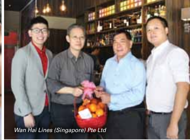
Wan Hai Lines (Singapore) Pte Ltd