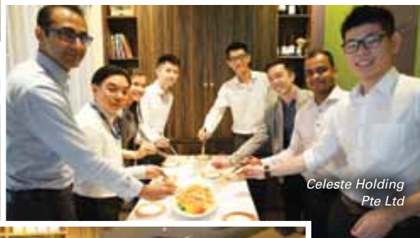
Celeste Holding Pte Ltd