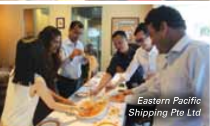
Eastern Pacific Shipping Pte Ltd