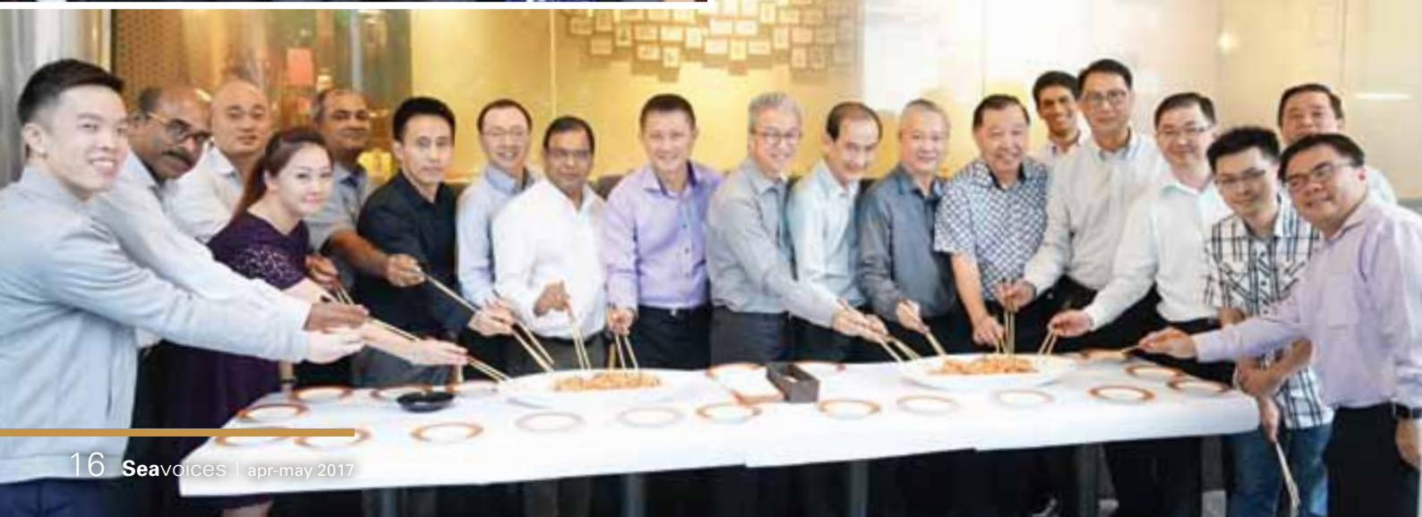
PACC Ship Managers Pte Ltd & POSH Fleet Services Pte Ltd