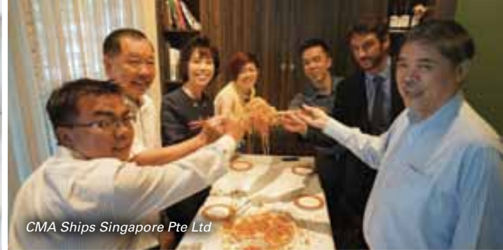
CMA Ships Singapore Pte Ltd