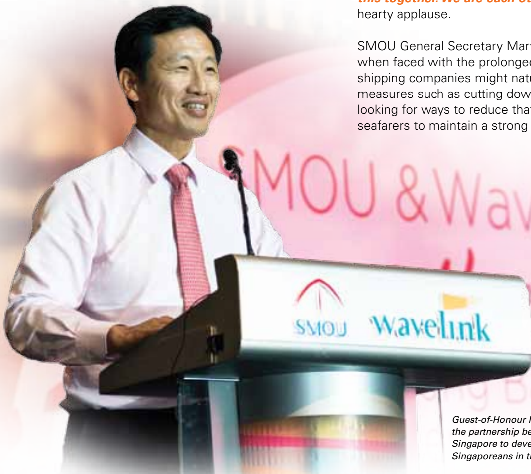
Guest-of-Honour Minister Ong Ye Kung announcing the partnership between SMOU and SkillsFuture Singapore to develop career pathways for Singaporeans in the maritime industry.