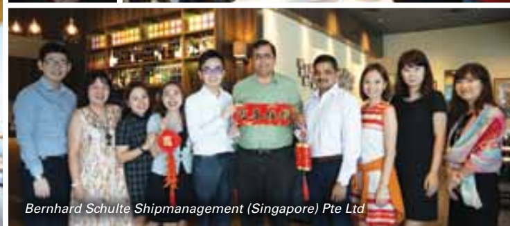
Bernhard Schulte Shipmanagement (Singapore) Pte Ltd