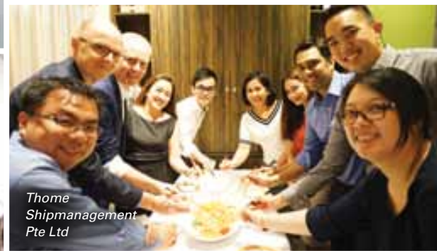
Thome Shipmanagement Pte Ltd