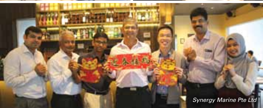
Synergy Marine Pte Ltd