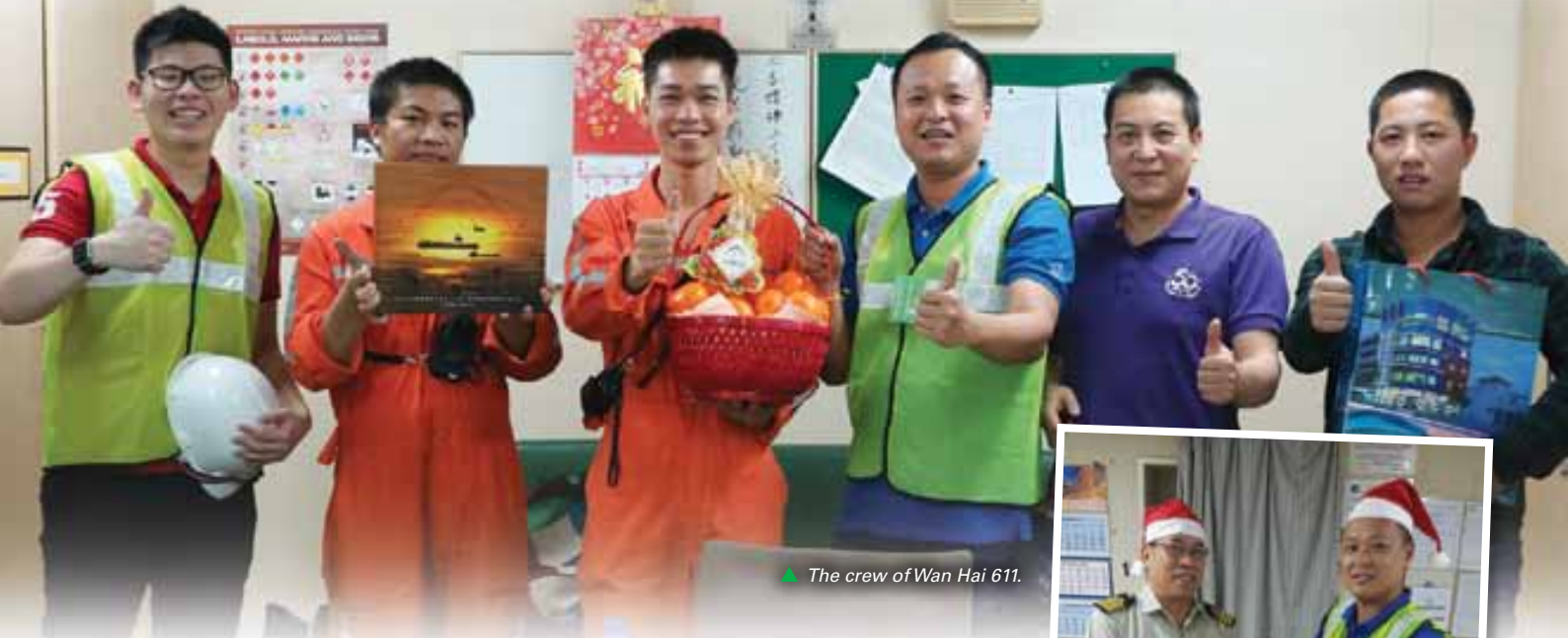
▲ The crew of Wan Hai 611.

Our seafarers work round the clock and even throughout the festive seasons, away from their families so as to ensure the cargo is delivered on time. SMOU officials visited vessels that have Collective Agreements with the union to appreciate our members' hard work and sacrifices, as well as to share the festivity with them.