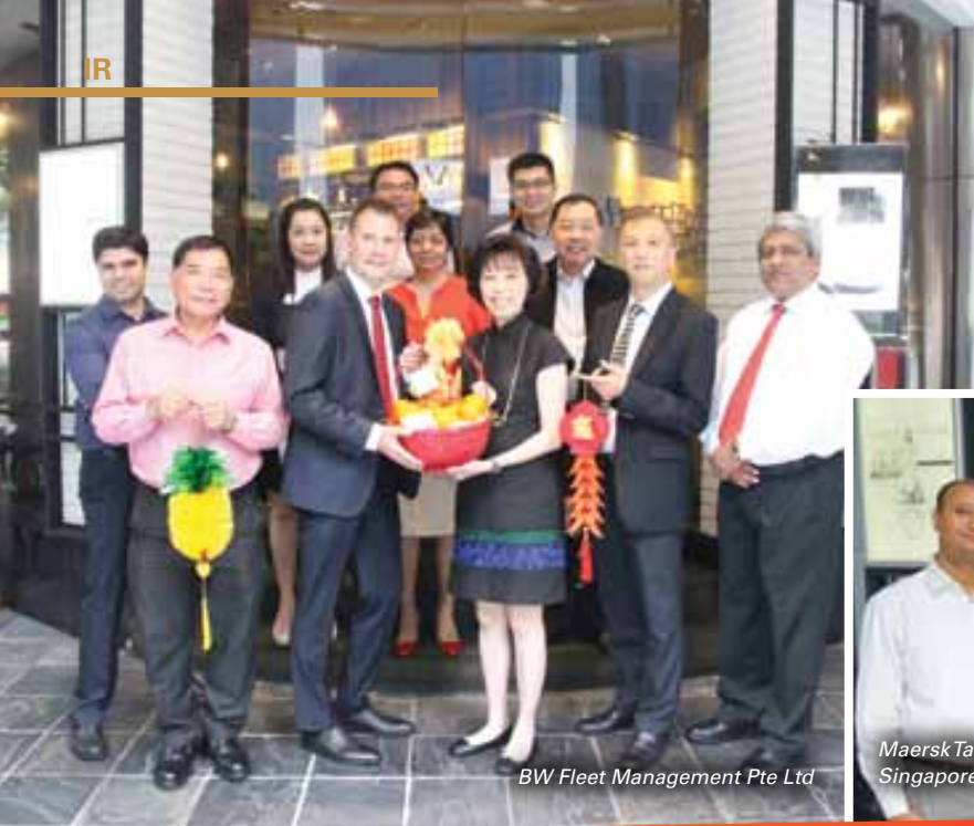
BW Fleet Management Pte Ltd