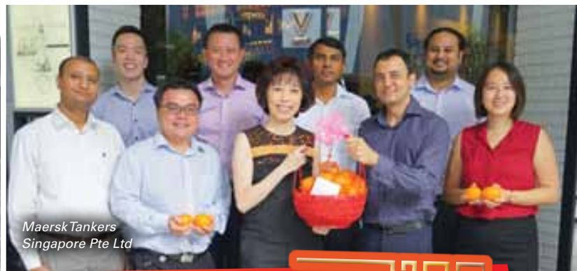
Maersk Tankers Singapore Pte Ltd