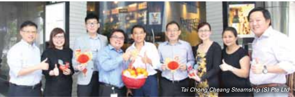
Tai Chong Cheang Steamship (S) Pte Ltd