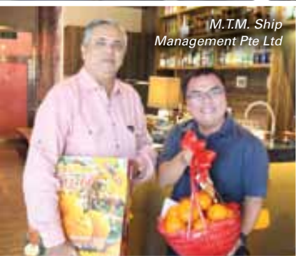
M.T.M. Ship Management Pte Ltd