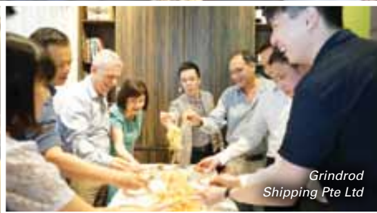
Grindrod Shipping Pte Ltd