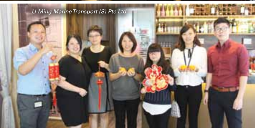
U-Ming Marine Transport (S) Pte Ltd