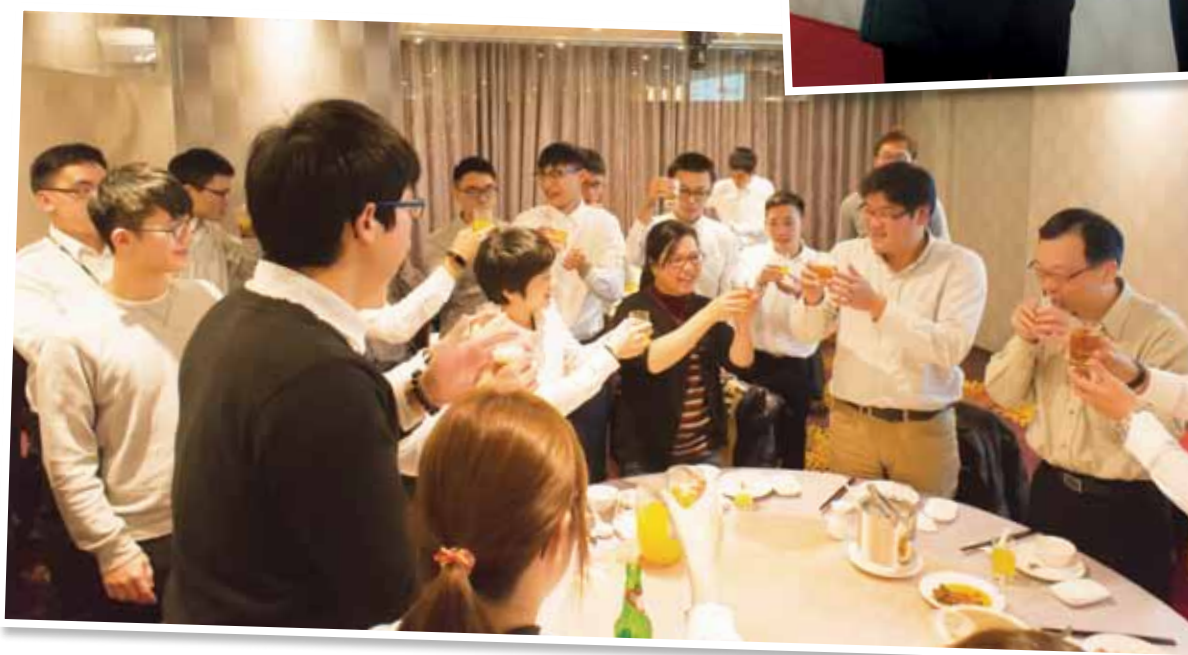
◀ A celebratory toast for the cadets' graduation.