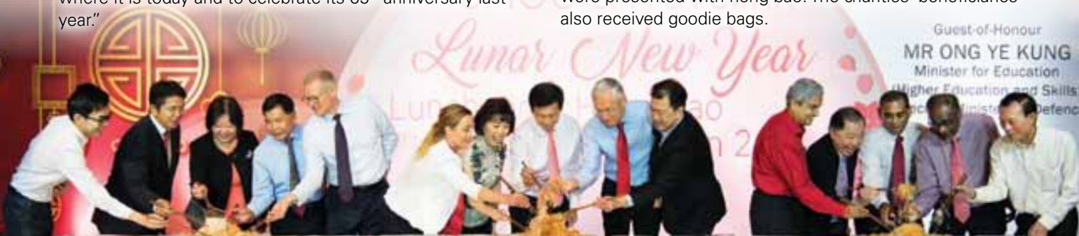
Guest-of-Honour MR ONG YE KUNG Minister for Education (Higher Education and Skills) and Second Minister for Defence

Being in tune with their well-being, SMOU has been giving over half a million dollars to some 6,900 elderly members and citizens for the past 19 years. This year, close to 550 elderly SMOU members and seniors from the various homes were presented with hong bao. The charities’ beneficiaries also received goodie bags.