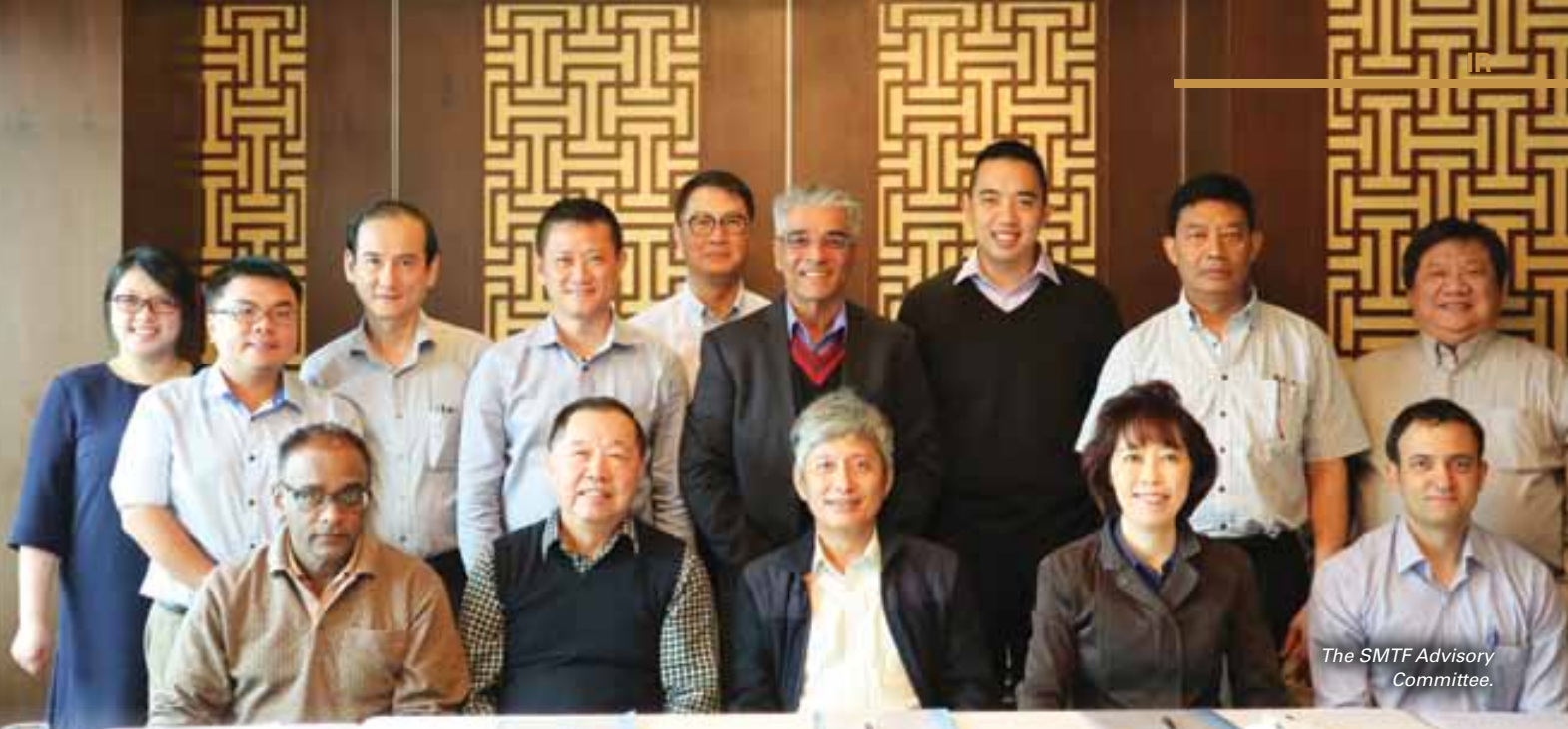
The SMTF Advisory Committee.