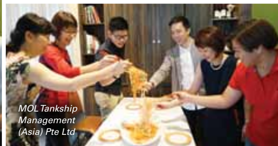
MOL Tankship Management (Asia) Pte Ltd