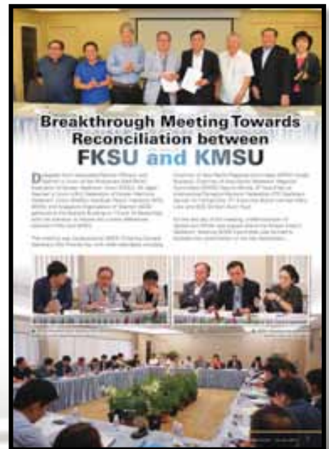
▲ For a recap of what took place during the previous meeting, refer to the Dec-Jan 2017 issue of SeaVoices.

Once again, solidarity was shown on both sides as the two Korean federations listened to each other's suggestions and collaborated to find ways to better represent their members.