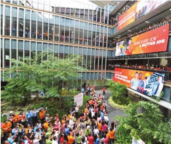
Rally held at the Devan Nair Institute for Employment and Employability, where the institute's official opening was graced by PM Lee.