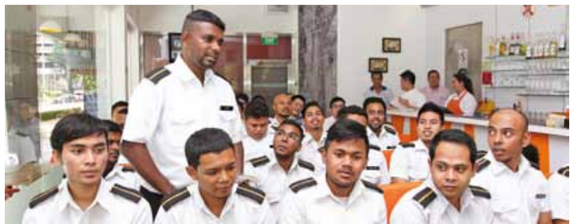
TNTA cadets participating in the Q&A session.