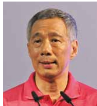
Prime Minister Lee Hsien Loong touching on the importance of skills upgrading for his May Day speech.

“Developing better workers and creating better jobs is our collective responsibility. Each tripartite partner must do their part: Workers must make the effort to train and upgrade themselves. Employers must invest in workers, develop their skills, and make full use of their talents. Only then will the Government’s programmes bear fruit. By working together, we strengthen our model of tripartism, and keep it our lasting competitive advantage.”