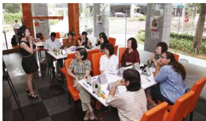
A Mary Kay representative talks about proper skincare techniques.

"I enjoyed the fact that the course was very hands on. We got to try out a lot of the products and there were demonstrations throughout the presentation."