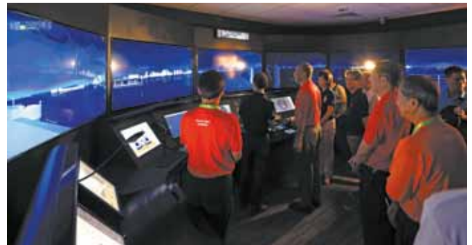
PM Lee experiencing the state-of-the-art facilities which can also emulate night-time experiences.