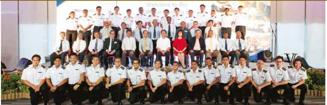
SMOU officials, shipping industry guests and TNTA cadets from Cohort 7 at the launch of the Wavelink Maritime Simulation Centre (WMSC).

Doing its part in encouraging Singaporeans to return to sea, SMOU will be sponsoring the first 20 Singaporean Deck Officers or Engineers for a free five-day simulator course worth S$40,000 from 26 to 30 of May 2014. Singaporean seafarers can utilise the simulators to have the applied learning advantage and will be more confident in their skills.