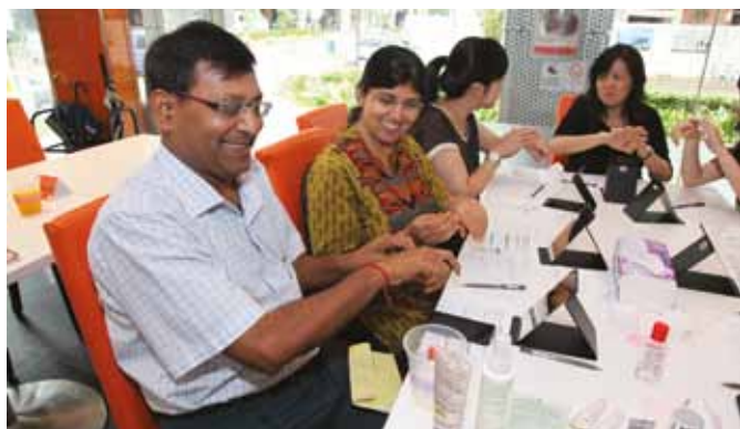
Members having fun testing out the products!

A beauty consultant from Mary Kay educated 14 participants on facial skin care on 12 April 2014 at Lighthouse Bistro. Through demonstrations and product sampling, the group got to learn the step-by-step procedure to proper facial care and of course not forgetting pampering themselves!