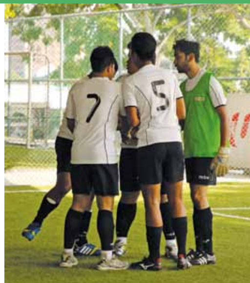
An intense discussion before the match starts.

A newbie to the challenge, the Young SMOU team put up a good fight and was thankful for the experience. To the participants, it wasn't just about a game of futsal. U Sports has been a platform for union members to enhance interaction and forge a strong community built on strong ties of friendship and a common passion for sports.