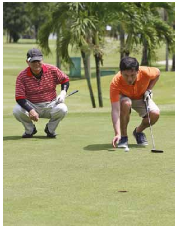
Preparing for the perfect putt.