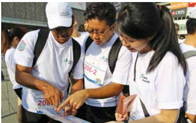
Young SMOU participants discussing their first pit stop for the hunt!

A strong supporter of building up the maritime community, SMOU's youths made sure they were in it to win it, raising three teams comprising of four members in each team. The overwhelming response added a buzz to the occasion with close to 300 teams. Competing against others, the Young SMOU teams had to strategise their travelling routes and compete in various physical and mental tasks in order to accumulate points.