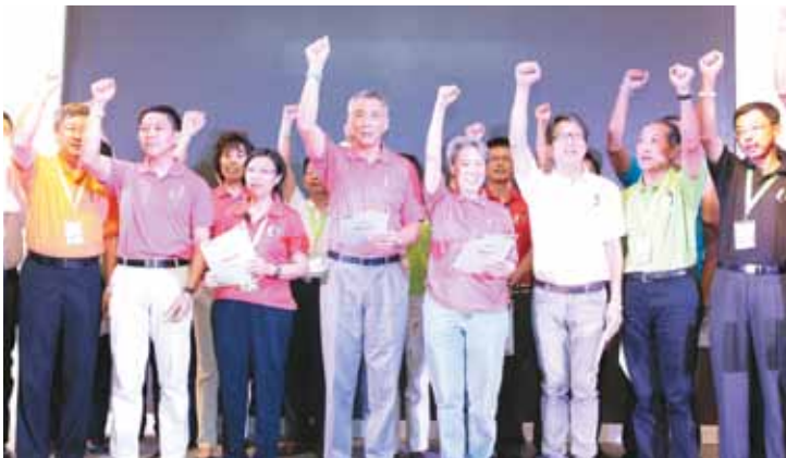
Reciting the May Day resolution at the Rally!