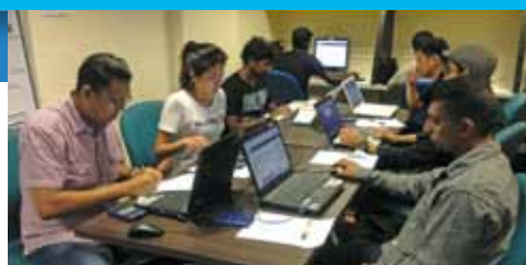
Candidates sitting for the Aptitude and Psychometric Tests.

WMI will put the shortlisted candidates who have met the basic requirements through comprehensive aptitude, psychometric tests and questionnaire on employment preference. While the aptitude test is specifically designed to assess candidates' competency in Maths, Science, Logic and Geography, the psychometric test objectively assess individual's traits to measure the response and suitability of an individual in a seagoing career. A questionnaire on employment preference will determine a candidate's career and employer expectations.