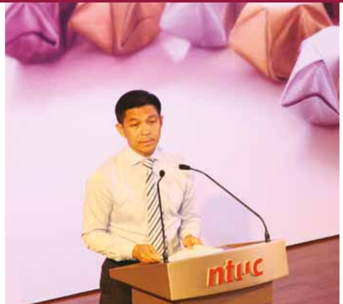
Minister for Manpower Mr Tan Chuan-Jin giving the keynote speech.

DPM Teo is also the co-ordinating Minister for National Security and Minister for Home Affairs, as well as Chairman of Council of Advisors for United Workers of Electronics & Electrical Industries and Advisor of The Singapore Manual & Mercantile