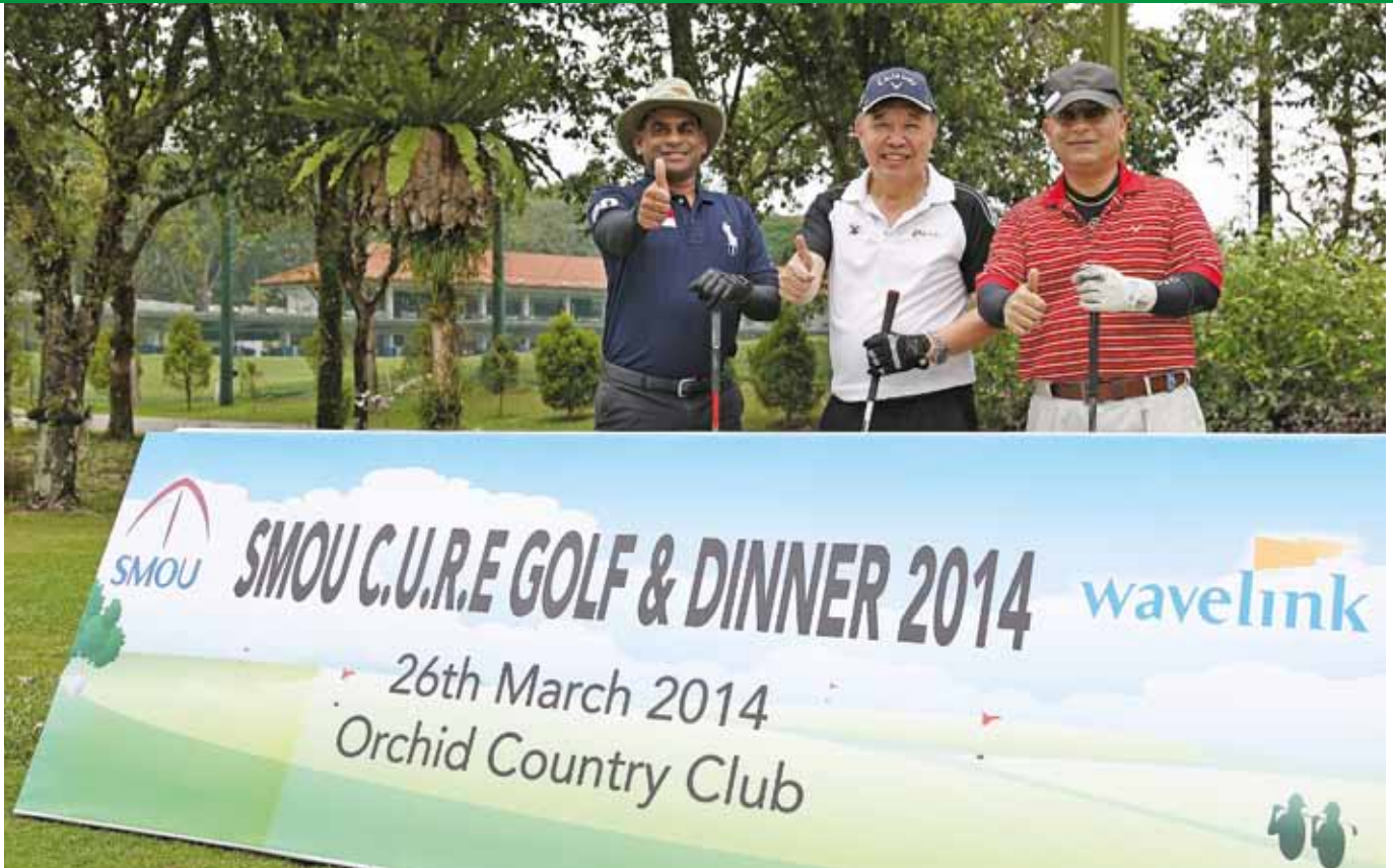
Golfers gather for the SMOU C.U.R.E Golf & Dinner event 2014.

The annual Companies Union Rapport Exercise (C.U.R.E) golf tournament is highly anticipated and a firm favourite with those in the maritime community. It provides an opportunity to engage in a relaxed setting strengthening relations as representatives come together from the union, shipping companies and government.