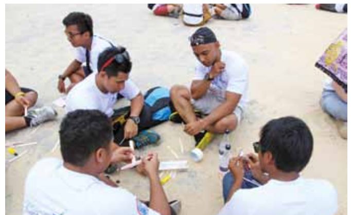
TNTA cadets building a ship together for the float test.

All in all, an amazing kick-start to an amazing week-long line-up of lectures by eminent speakers, dialogue, exhibitions and social events that reflect the vibrancy and diversity of Singapore as a major international maritime hub.