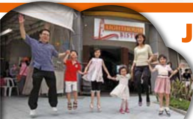
Having fun at the Family Connection!