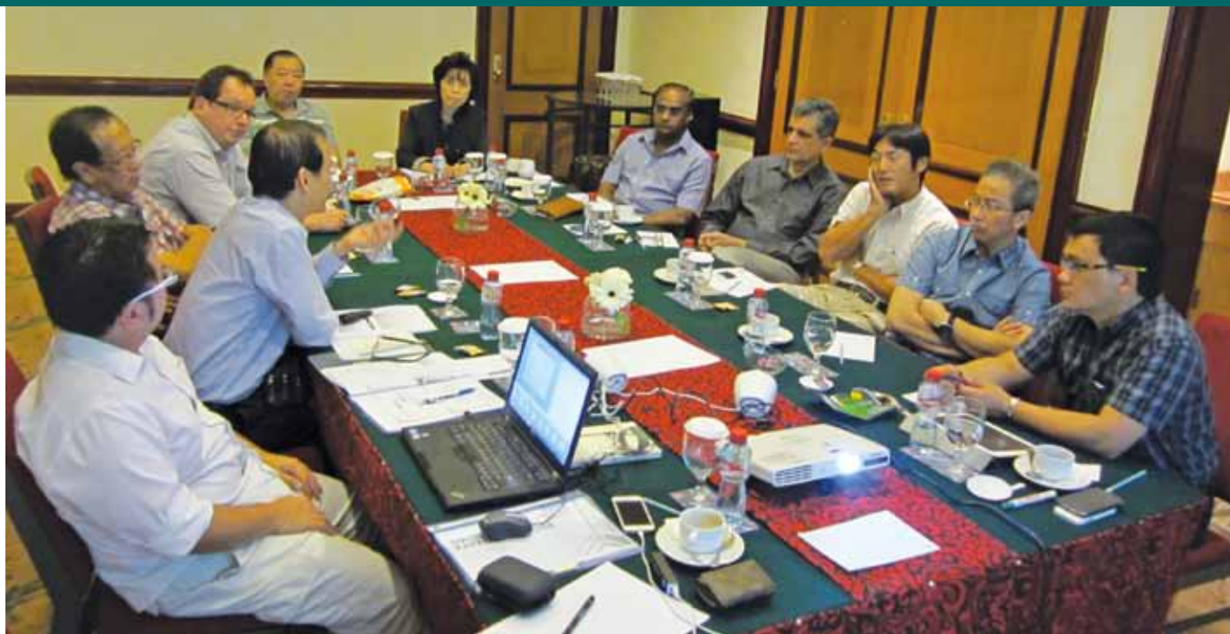
SMOU and Wavelink officials with shipping company representatives in thought-provoking discussions and presentations.

Building the Singapore's maritime core was given a further boost at the impactful Company Union Rapport Exercise (C.U.R.E) retreat initiated by SMOU.