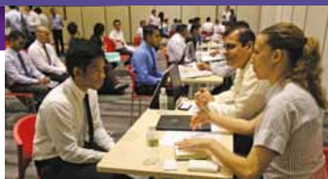
Bernhard Schulte ShipManagement representatives assessing a potential candidate.

Shortlisted candidates from interview will be matched to companies according to their preference indicated in the employment preference questionnaire. Shipping companies will interview these candidates. Successful candidates will commence Phase 1 Pre-sea Course which takes six months.