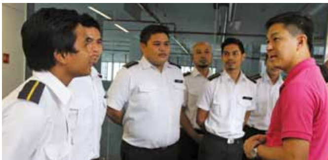
Minister for Manpower Mr Tan Chuan-Jin listening earnestly to a TANTA Cohort 6 cadet sharing his journey.

On the Devan Nair Institute, PM Lee pointed out: “It looks a handsome building. But it is not just a building; it is what is inside it – offering services catering to different skills and workers. I had a mini tour around earlier. I was very impressed with the facilities, with the courses being offered...”